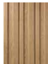
Golden Oak MCBF360G