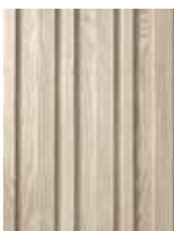
Limed Oak MCBF360L