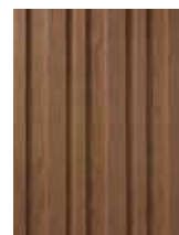
Coppered Oak MCBF360C