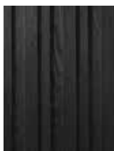
Burnt Cedar MCBF360R