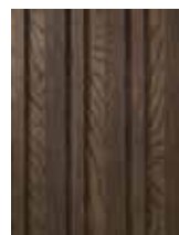
Antique Oak MCBF360A