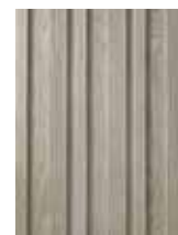
Smoked Oak MCBF360D